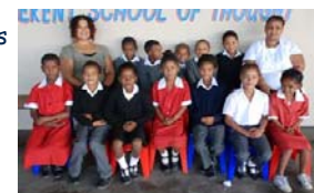
Volunteer Teachers with Class