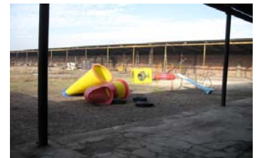
Scenes from the Scrapyard School April 10, 2009