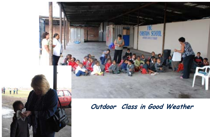
Outdoor Class in Good Weather

More details: www.classrooms4a.org/c4a_special_scrapyard.html